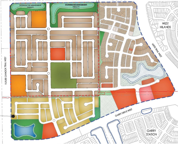
Proposed Outline Plan Amendment